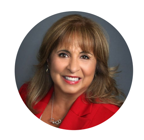
Houston Community College: President, Southeast College & Interim VC of Student Services