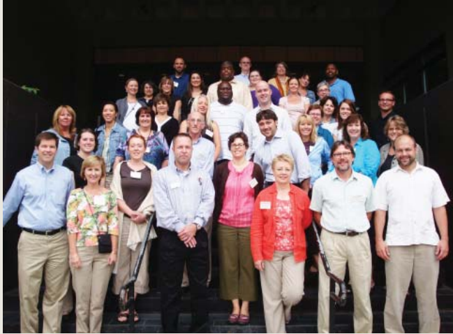
The 2009 SIYM presenters and participants